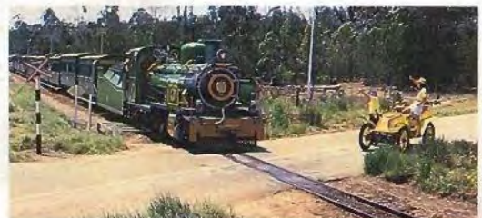
Darracq arrives at Thornhill just ahead of 'Granny Smith'.