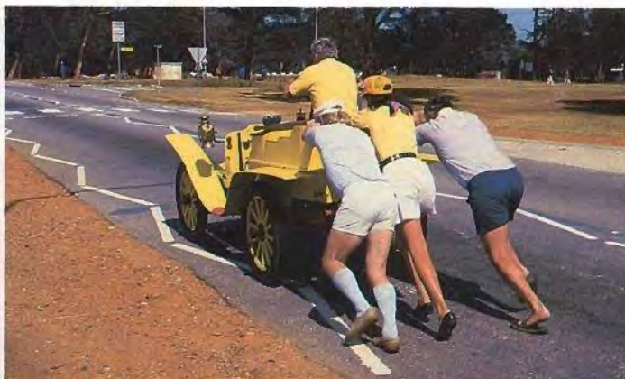
The Fine Cars pushing team had to work hard at the beginning.

(I was unable to find the exact date of this great race, but it was either late 1988 or early 1989).