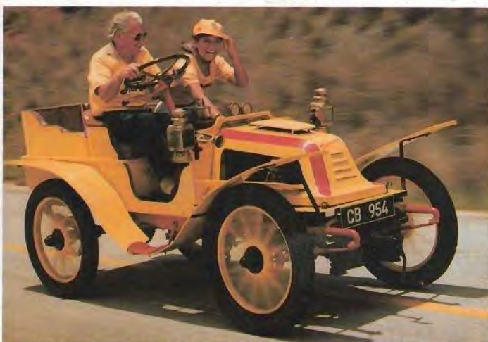
The victorious Opel-Darracq eating up the Ks on its way to Loerie