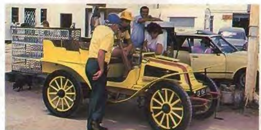
Last fuel stop at Thornhill.